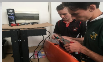
Remove/install Electrical Components